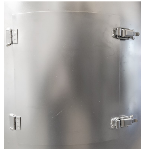
Double Latch Clean-Out Door